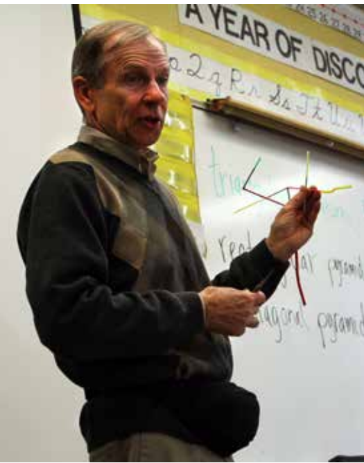
Third grade class, Black Butte Elementary School in Shingletown (Shasta County)

The Cal State Long Beach UTEACH program has been placing candidates in Long Beach elementary schools for five years. Candidates spend the school year splitting their time between the K-12 classroom and university classes taught on site by Cal State Long Beach faculty.