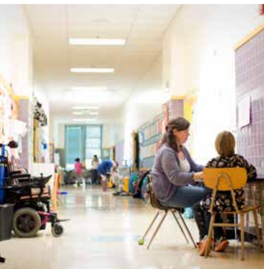
Redwood Heights Elementary School in Oakland

The center pointed out that improvements would largely need to happen at the school level. It recommended that schools carefully track specialists to determine why they leave—and then attempt to fix those issues, including finding ways to improve the relationship with general classroom teachers and reduce the paperwork burden shouldered by special education teachers.