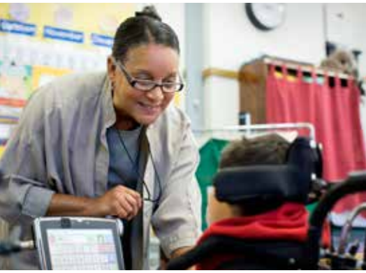
Special education class, Redwood Heights Elementary School in Oakland

“I feel we need to bring special education and general education closer together—in the field and in preparation programs. Throughout many institutions of higher education, the faculties in these two areas don’t work together, don’t talk together, don’t collaborate...and I think in the field often the same thing happens.”