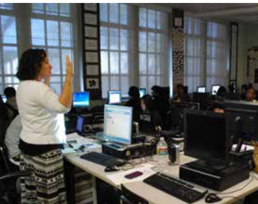
Eleventh grade computer programming class, Foshay Academy in Los Angeles

“New teachers are shocked at how hard this job is.”