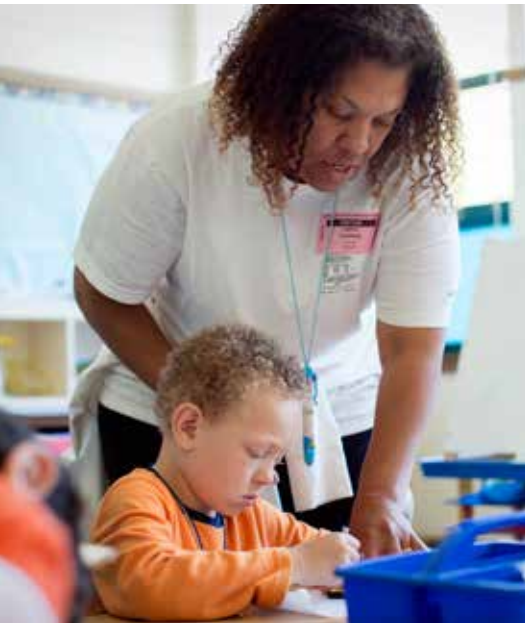
Kindergarten art class, Redwood Heights Elementary School in Oakland

California currently has a two-tier credentialing process (a preliminary credential followed by a clear credential), but at least 17 states have a three-tier process that promotes the best teachers to a top leadership tier. In 2011, Ohio even instituted a four-tier system—starting with a “resident educator” license and followed by “professional educator,” “senior professional educator,” and “lead professional educator” licenses. Ohio’s top two tiers are optional and require a master’s degree and at least nine years of experience.