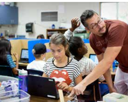
Fifth grade class, Redwood Heights Elementary School in Oakland

“The problem is that for people who want to teach, the current system separates the ‘what to teach’ and the ‘how to teach’ into two entirely separate components instead of allowing them to be learned in an integrated fashion.”