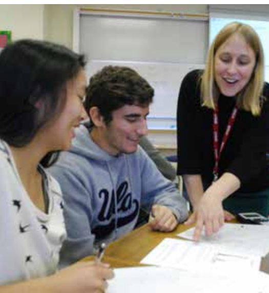
Twelfth grade calculus class, Glendale High School in Glendale

20 percent had pulled all funding, and another 17 percent had shifted away a substantial amount, analysts found. 63 A survey by the RAND Corporation showed even higher figures. According to the survey, half of school districts eliminated all funding for the program in 2010-11, and only 33 percent of schools kept their programs fully intact. 64