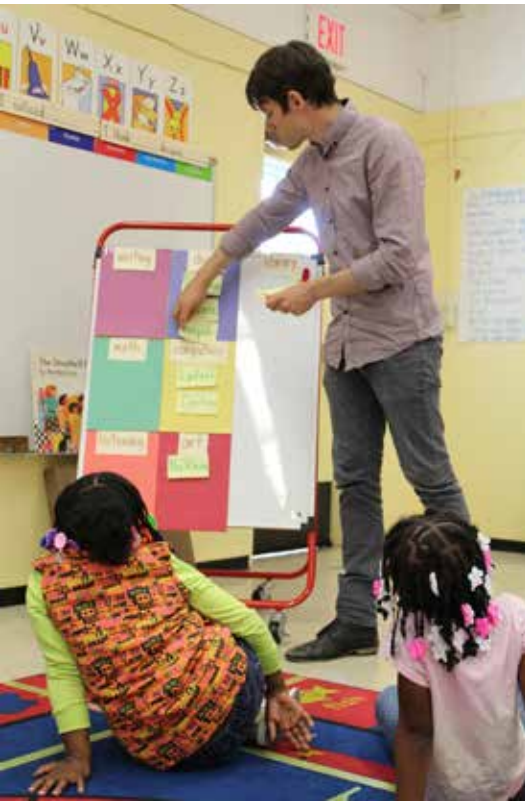
Summer pre-kindergarten class, Martin Luther King Elementary School in Oakland

“Attention to the preparation of early childhood educators is important both because of the growing appreciation for the importance of early learning—and the attendant expansion of access for more young children—and because research has documented the need for and benefit of well-prepared teachers with specialized knowledge to provide this instruction.”