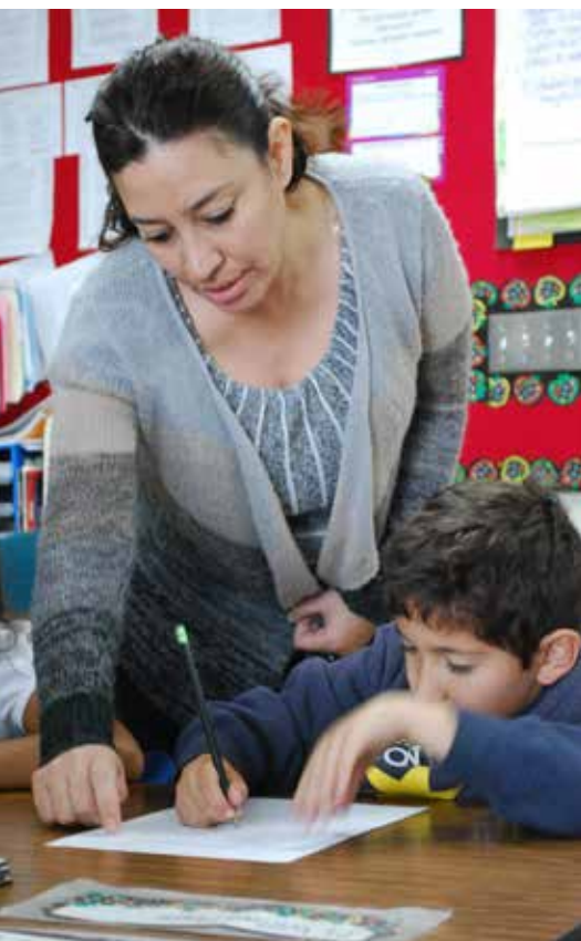
Second grade class, Edison Elementary School in Glendale

CHALLENGE #6: New teachers are having increasing difficulty getting access to high-quality support programs with experienced mentors, also known as “induction” programs. Such support is crucial to ensure that they are effective in the classroom and that they stay in the profession.