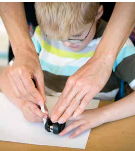
Kindergarten art class, Redwood Heights Elementary School in Oakland