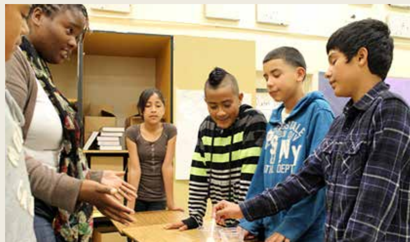
Seventh grade chemistry class, Coliseum College Prep Academy in Oakland

It is self-evident that many young people with strong math, engineering, science, and computer backgrounds may be tempted to choose more lucrative career opportunities. Attracting them to the teaching profession and then ensuring—through strong support and meaningful career pathways—that they stay will be essential for successful implementation of the Next Generation Science Standards and STEM curricula in general.