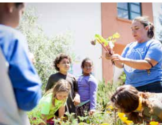
Second grade garden class, Redwood Heights Elementary School in Oakland

This is especially important as the state moves to the “response to intervention” (RtI) approach, which hinges on all educators working together to identify students that may need extra support. RtI is a process in which instead of waiting for students to fail, their needs are identified early and, with a team-based approach, addressed with the appropriate support. Placement in a separate special education program is only prescribed when absolutely necessary.