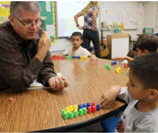
Kindergarten class, Robinson Elementary School in Fresno

“The one thing I fundamentally disagree with is the idea that anyone can step into the classroom and teach kids.”