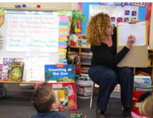
Transitional kindergarten class, Carver Elementary School in Long Beach