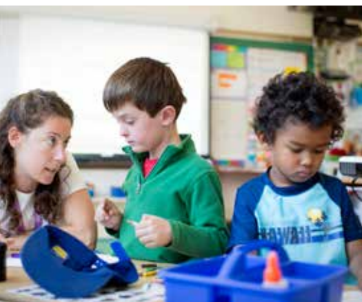
Kindergarten art class, Redwood Heights Elementary School in Oakland

CHALLENGE #3: California’s teaching credentials don’t focus on early childhood or middle school, leaving many teachers less prepared for these critical periods in a child’s development.