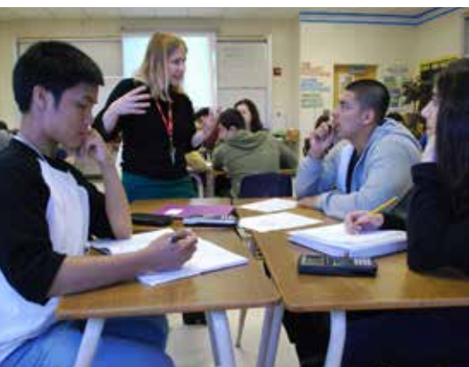
Twelfth grade calculus class, Glendale High School, Glendale