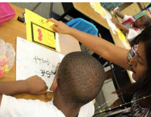
First grade class, Ayer Elementary School in Fresno